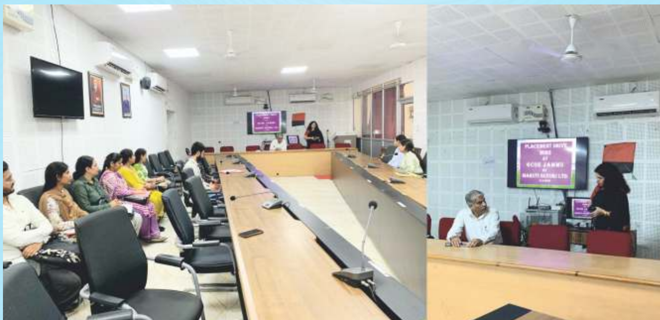
Placement Drive With Maruti Suzuki organized on 19 th September, 2025

"Step in with dreams, step out with opportunities."