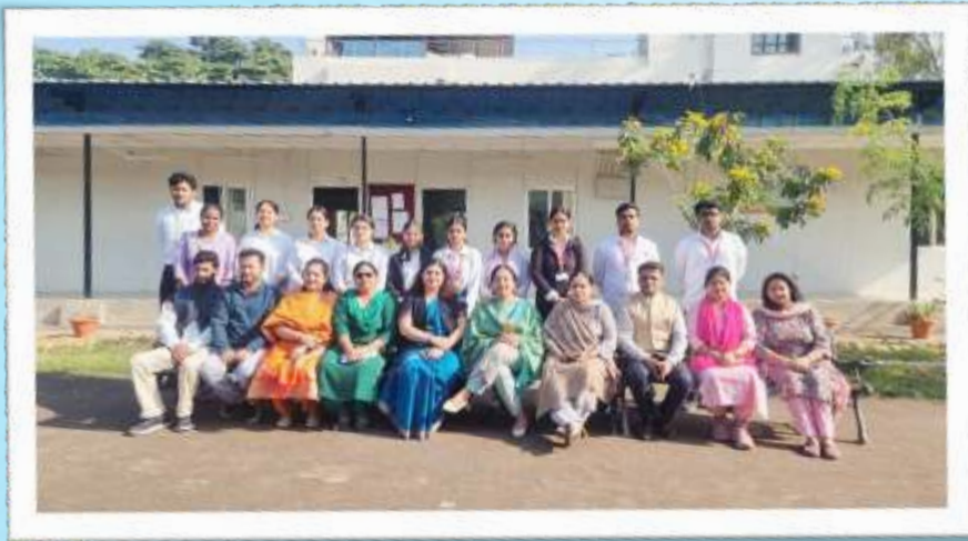
ITEP 1 ST BATCH

"Curiosity is the spark that lights the path of knowledge."