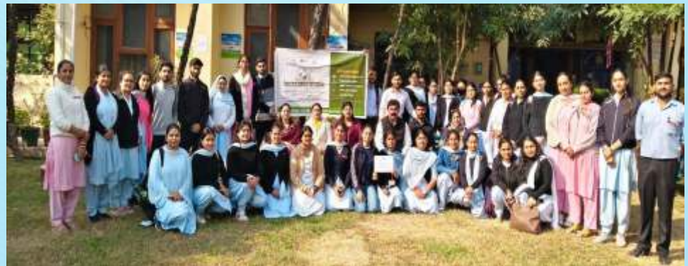
GCOE, Jammu declared as Green Champion under the Green Campus Initiative by JMC, Jammu on 20 th November 2025.