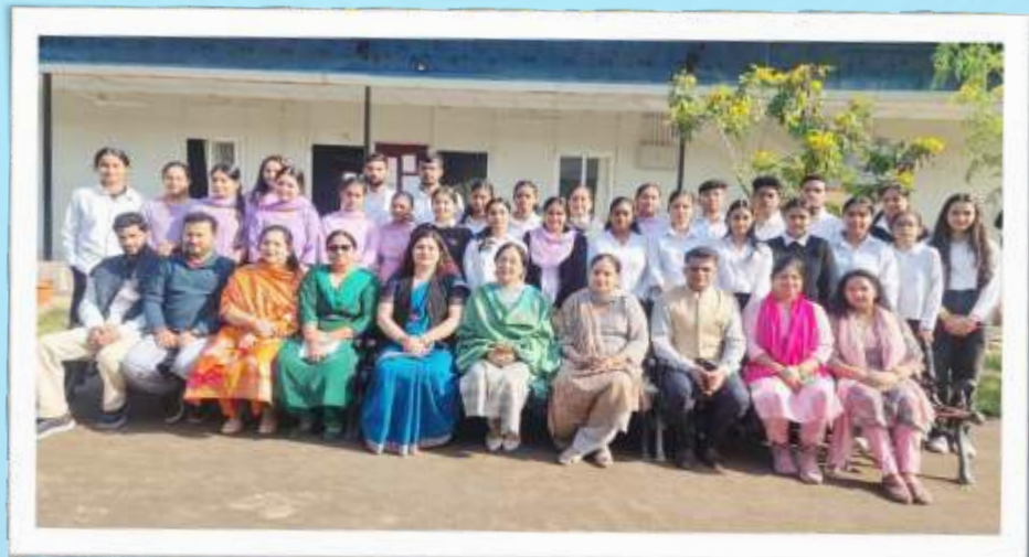
ITEP 1 ST AND 2 ND BATCH

"The next chapter of dedication and progress."