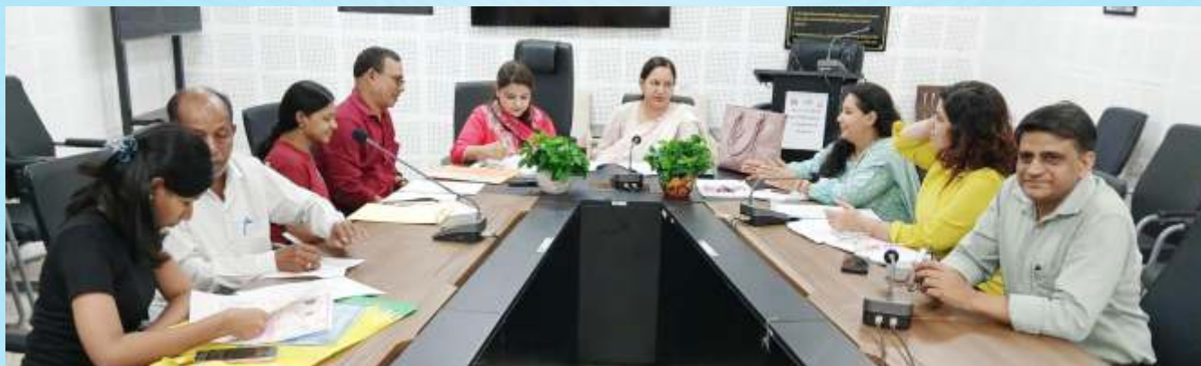
Admission of Second Batch of ITEP commenced from 14 th July 2025.

"The beautiful thing about learning is that no one can take it away from you." July 2025