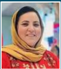
Ms. Sakina Itoo Minister of Education (Government of UT of Jammu and Kashmir)