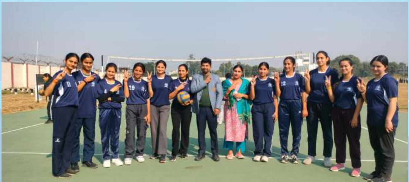
Team GCOE volleyball women beat MAM P.G. College and G.G.M. Science College by 2-0 and reach final of inter college Volleyball tournament organised by GCE Gandhi Nagar