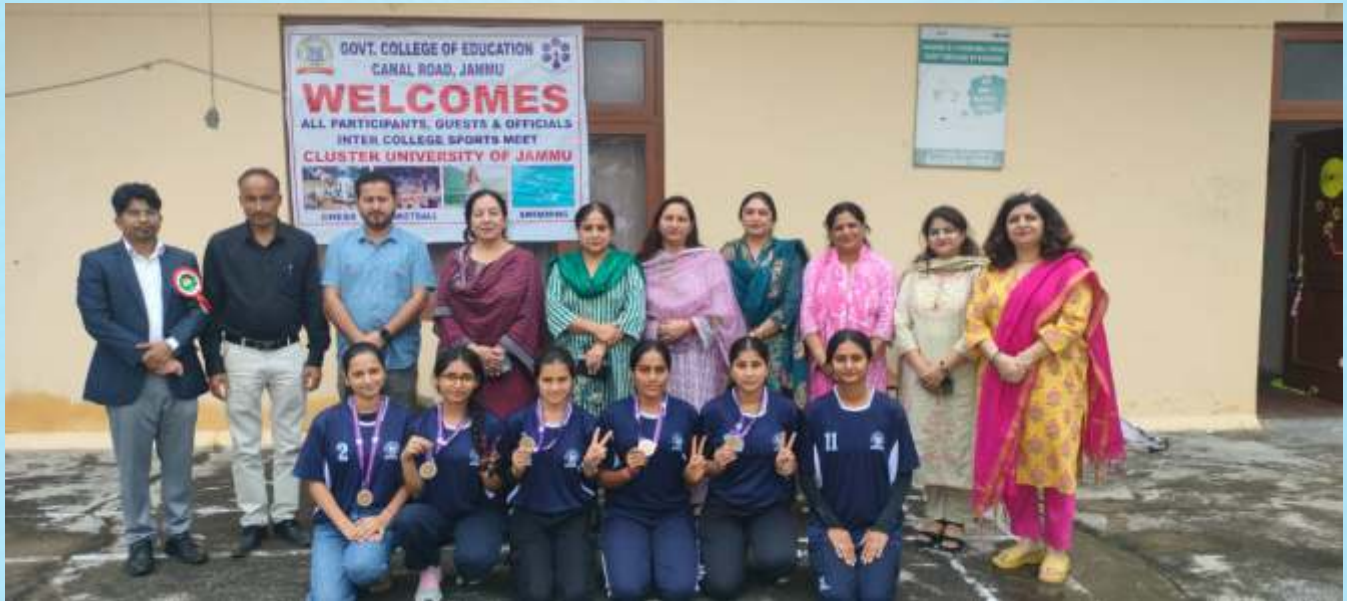
GCOE Yoga women team won silver medal in Inter college Yoga competition organised by GCOE.

“Sports build strength, spirit, and success.”