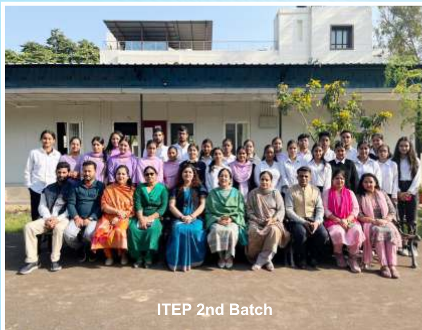
ITEP 2nd Batch

Integrated Teacher Education Programme (ITEP) at GCOE Jammu, has rapidly established itself as a pioneering force in teacher education, marking a significant success story in its initial two years. The program, designed in alignment with the National Education Policy (NEP) 2020, aims to transform the landscape of teacher preparation and increasing demographic diversity are a testament to its effectiveness and burgeoning reputation.